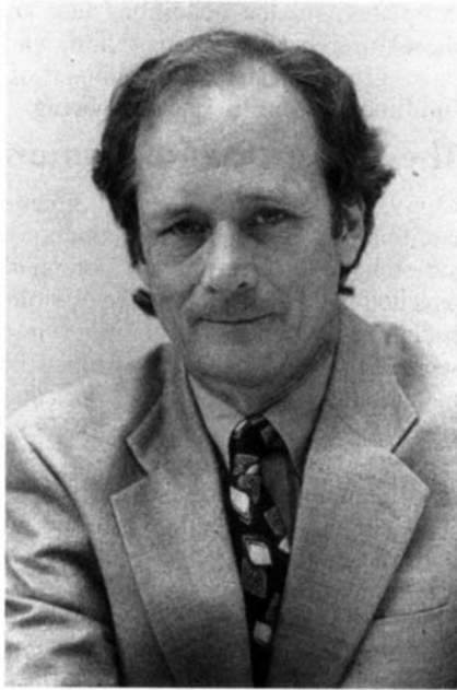
Edward L. Deci