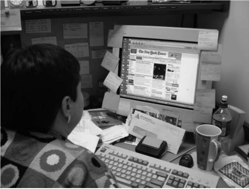
Figure 10.1 Example of Sociomateriality in Office Work.

be performative if it contributes to the constitution of the reality that it describes (Callon, 1998).